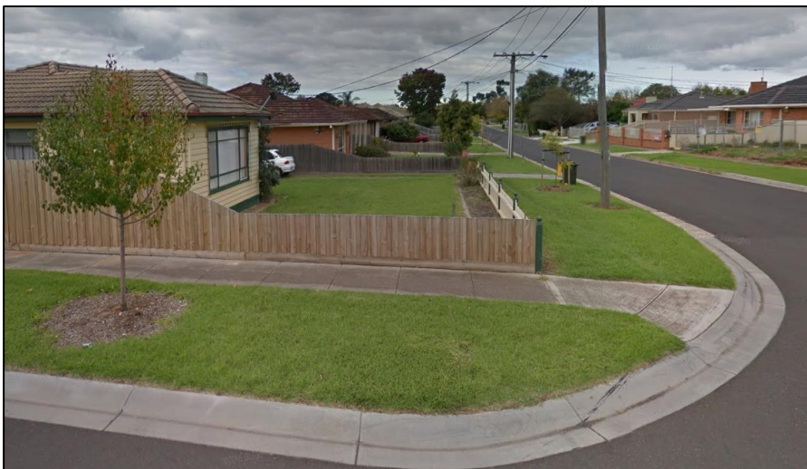
Fence height is reduced at an intersection to provide for driver visibility

Before constructing any front fences on a corner lot please contact Council's Engineering Development Officer for advice on 6424 0511.