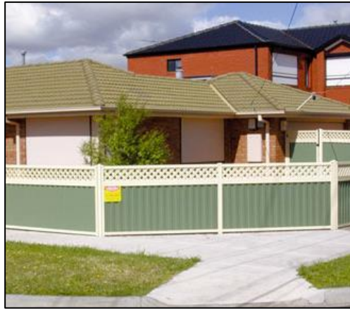
Another example of a front fence with both solid and transparent construction

Fences can also be transparent for the total height of the fence, there is no need to have a solid section.