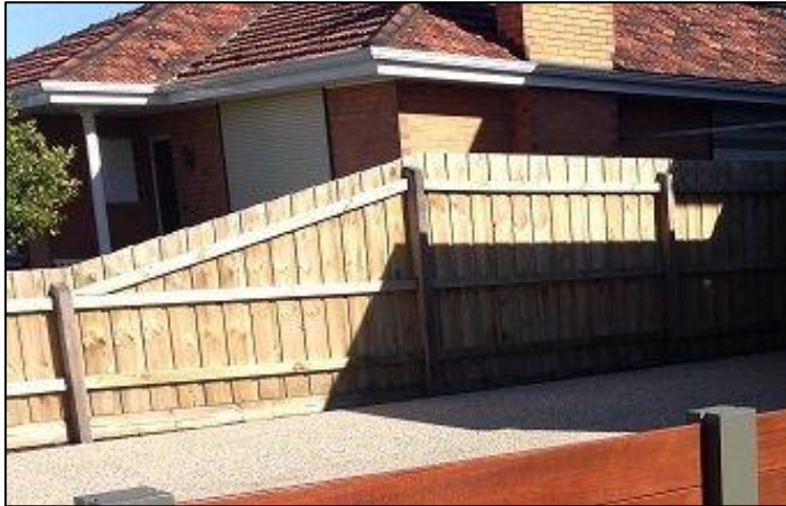
Fence height is reduced close to front boundary

The height must be reduced within 4.5m of the front boundary to comply with the requirements for front fences (see above).