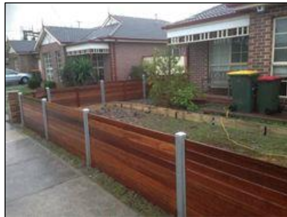
A solid front fence is permitted if no higher than 1.2m