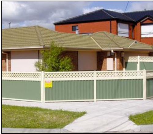
Another example of a front fence with both solid and transparent construction

Fences can also be transparent for the total height of the fence, there is no need to have a solid section.