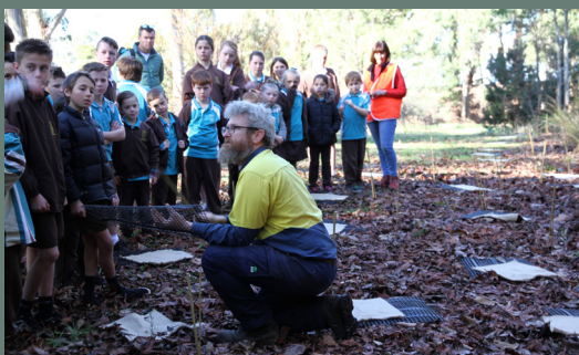
Image: School Children planting seedlings in a Devonport reserve.

Council's Natural Resource Manager works with many local schools and Volunteers to improve the biodiversity of Devonport.