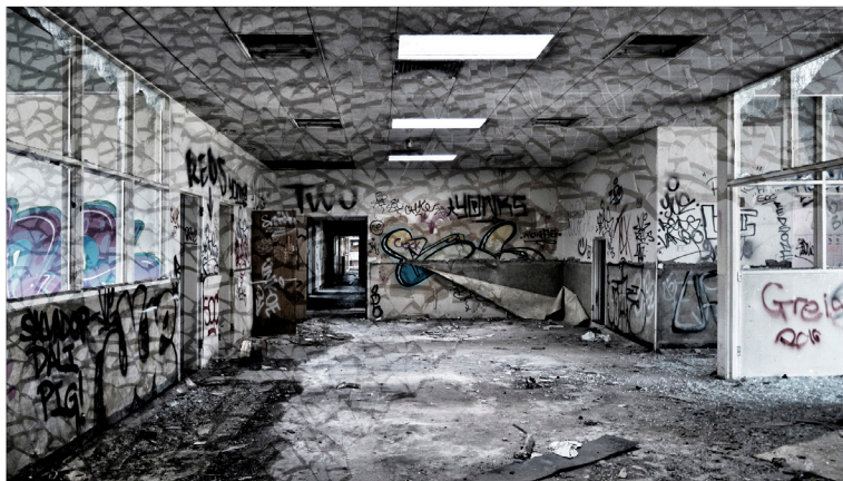
ROUTINE, DEMOLITION, EXIT

Image: Anne O'Connor, Routine, Demolition, Exit , 2019, photograph. Image courtesy of the artist.