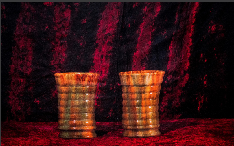
Image: Liam James, A place to hold flowers (Pair) (detail) , 2019, photographic cotton weave rug.