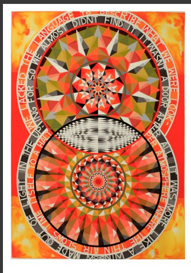
Image: Tricky Walsh, interference patterns in time , 2019, gouache and watercolour on paper.