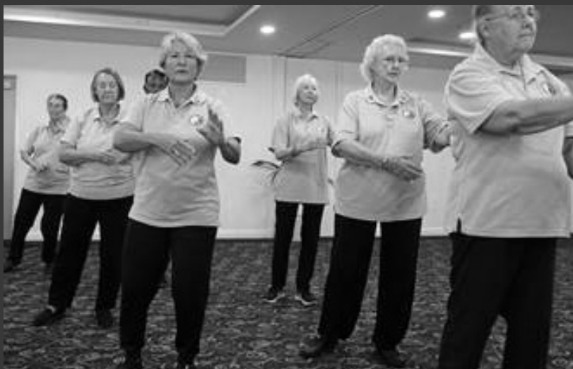
Image: Beginners Tai Chi

Wednesdays, 1pm Wednesdays, 2pm Thursday, 1pm