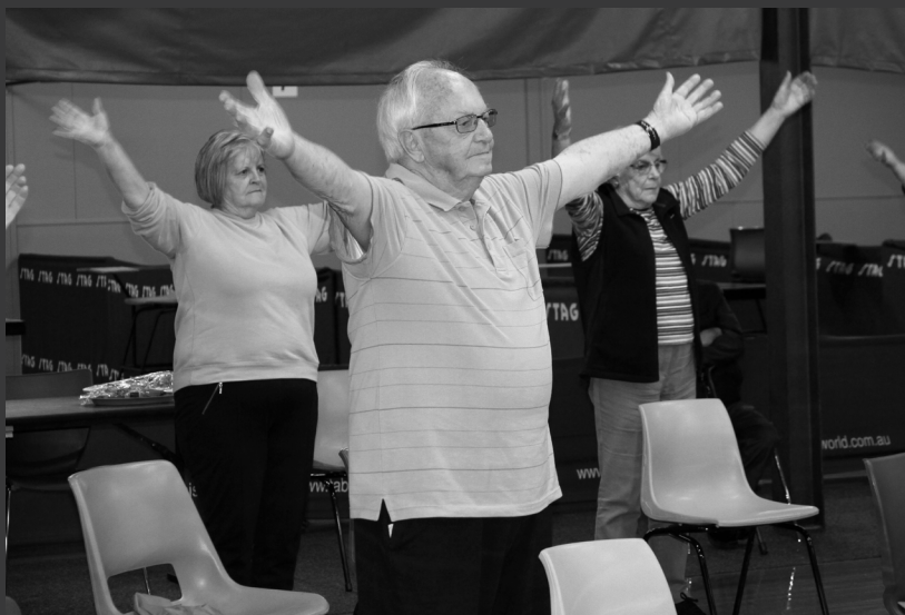
Image: Ageing Stronger Active Longer Program 2019

Tuesdays, 1pm Wednesdays, 2pm Thursdays, 12pm