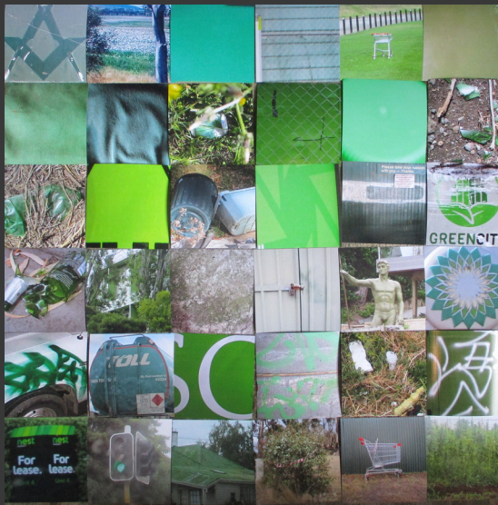
Image: Joey Gracia, Green Day 2 , digital prints on paper.