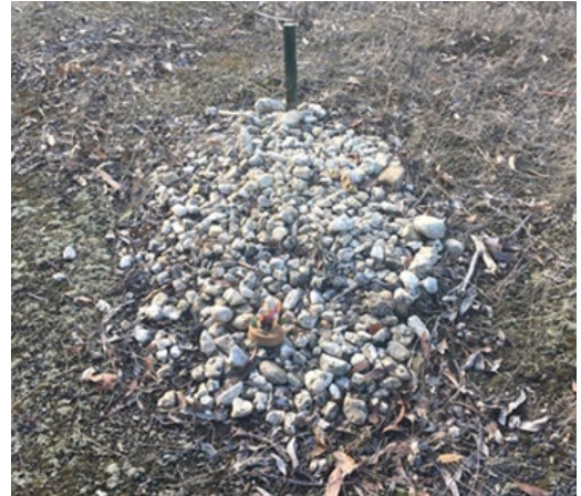
Unmarked child's grave

There are 3,405 known recorded burials and several unmarked sites. The historical burial records are incomplete. The cemetery is closed to new burials, with only reserved plots and re-openings available.