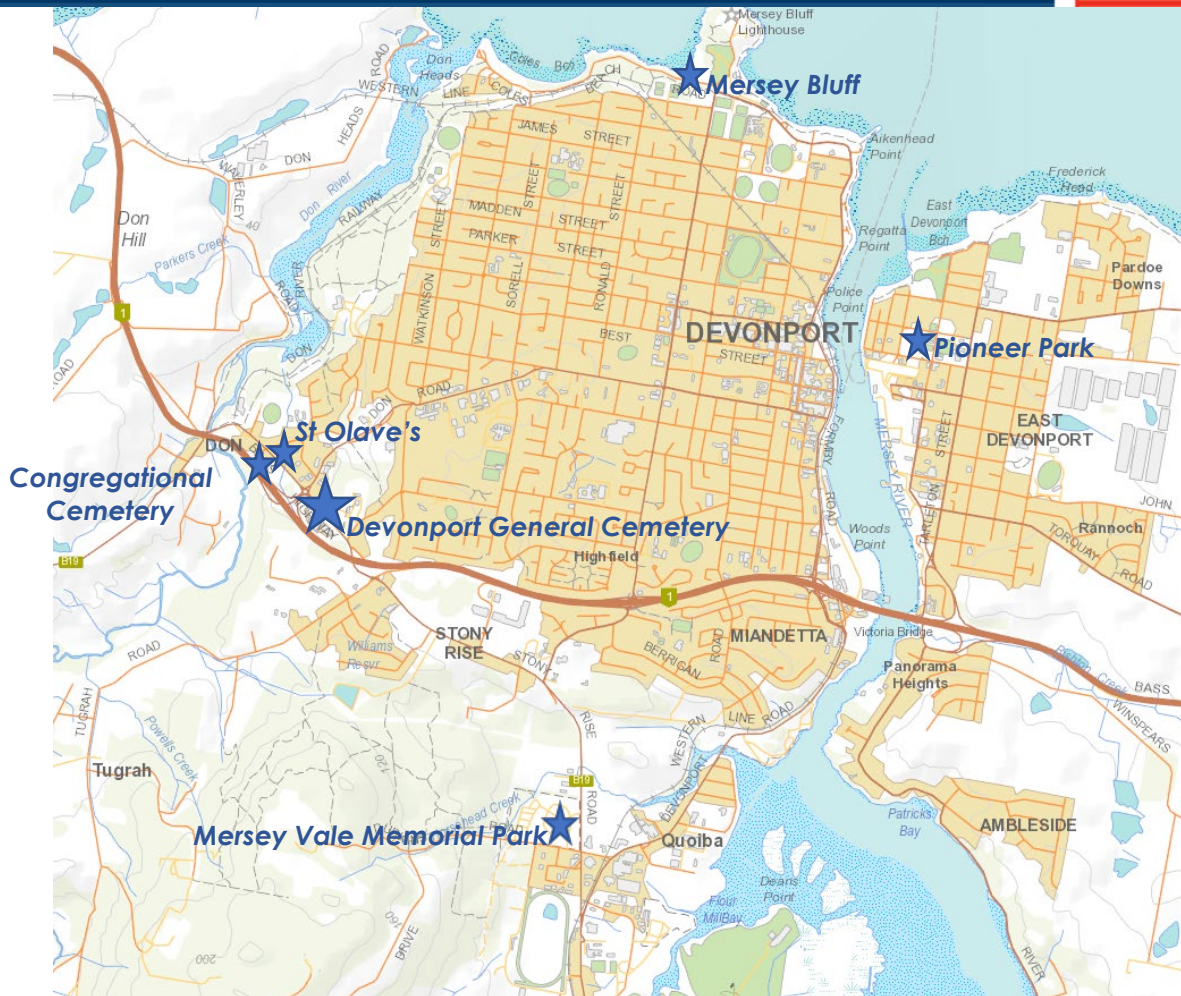
Location Context – Devonport General Cemetery