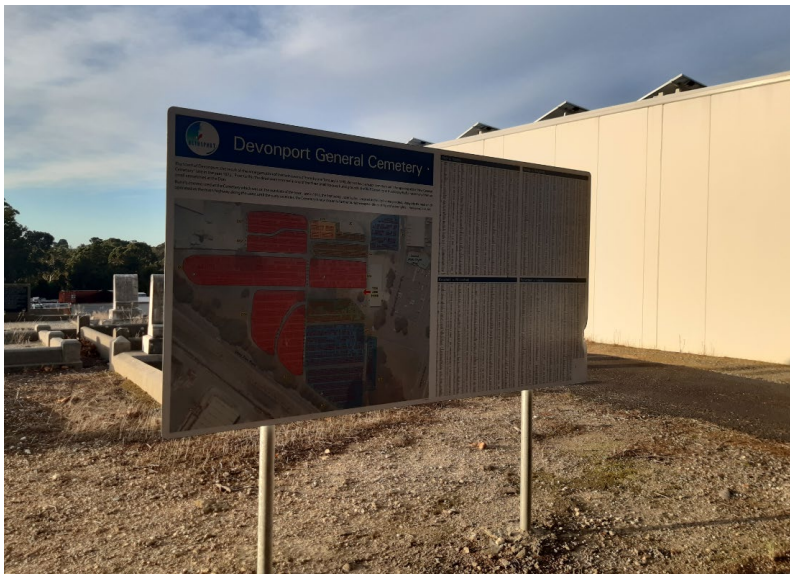
Improvements since 2009

Other than the installation of a sign displaying burial records and locations and some basic signage for each section, the issues identified in 2009 remain largely unaddressed.