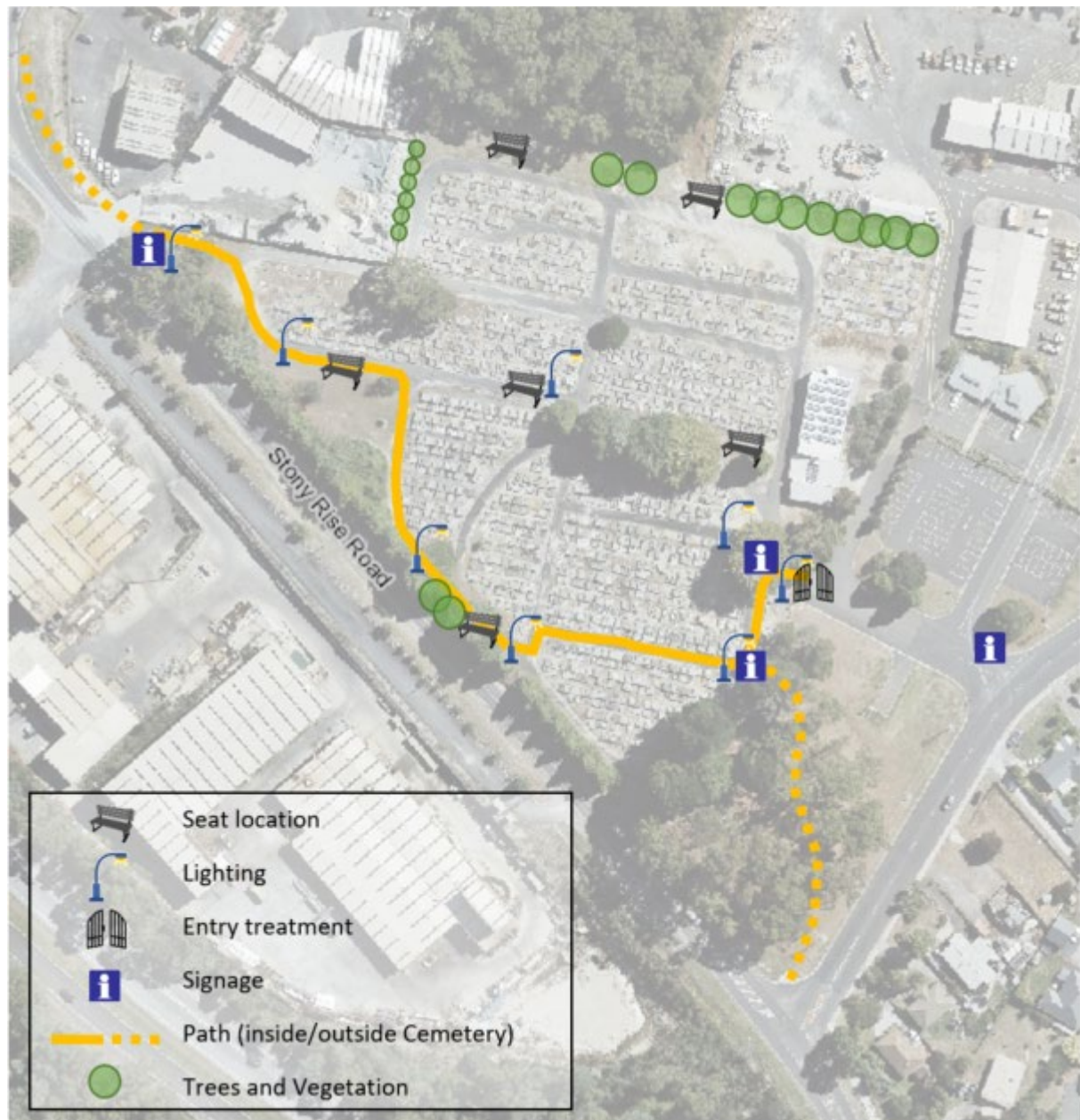
Action Plan – Concept Layout

The infrastructure improvements proposed in the action plan are shown in the plan below. The locations and details, where provided, are conceptual and should be confirmed during the design phase of each project.