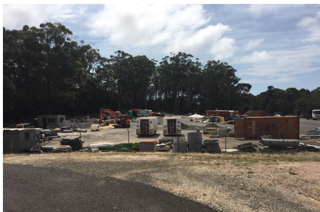
Landscaping along cemetery boundaries will improve amenity