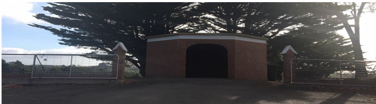
Cemetery main entrance and rotunda