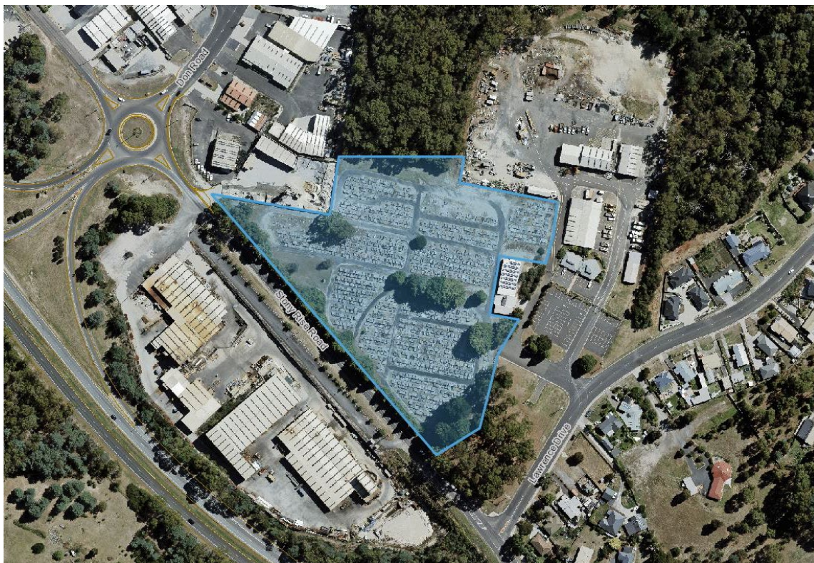
Location – Devonport General Cemetery