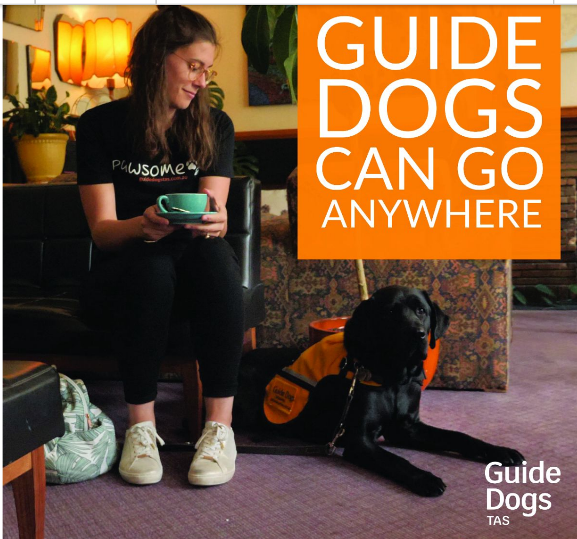
Guide Dogs Tas