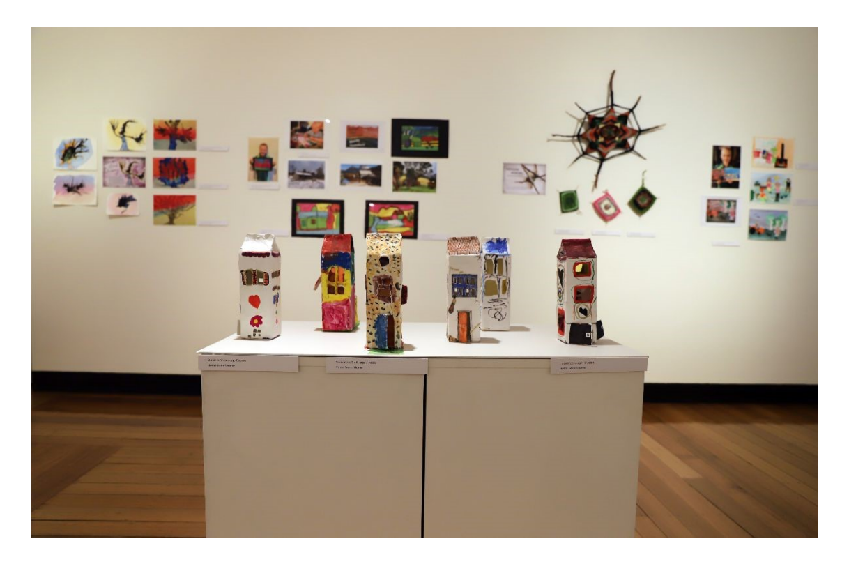
Home Is Where The 'Art Is

Grass/Lands Upper Gallery 8 May - 19 June 2021