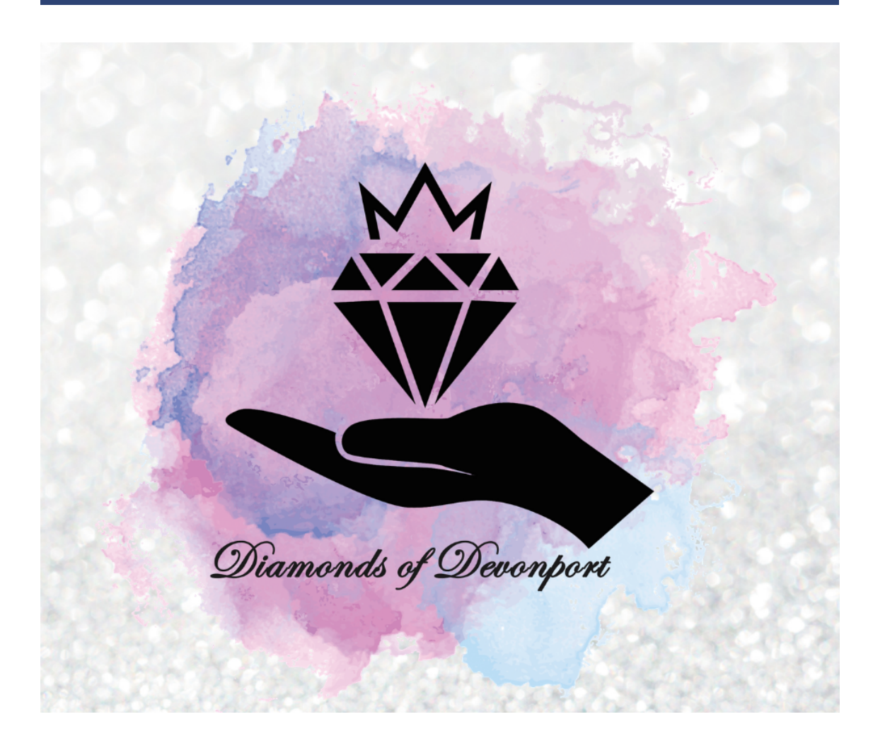
Diamonds of Devonport