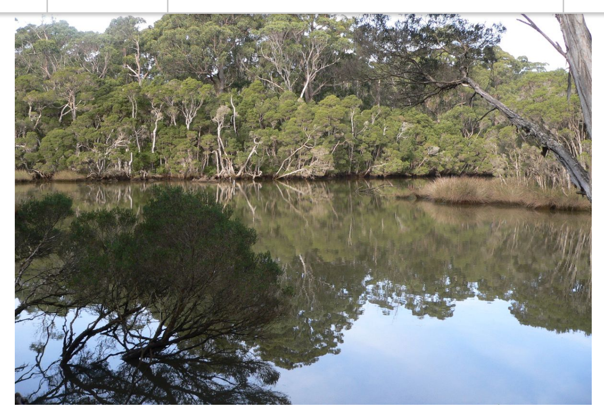
Thank you Reece High School Students

Thank you to Reece High School for spending time collecting rubbish from Don Reserve!