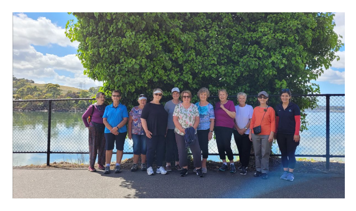
Christmas Break for Council Sport and Recreation Activities

To secure your spot, please register through <u>Eventbrite</u>. This free breakfast event is brought to you thanks to Devonport City Council and <u>Healthy Tasmania</u>