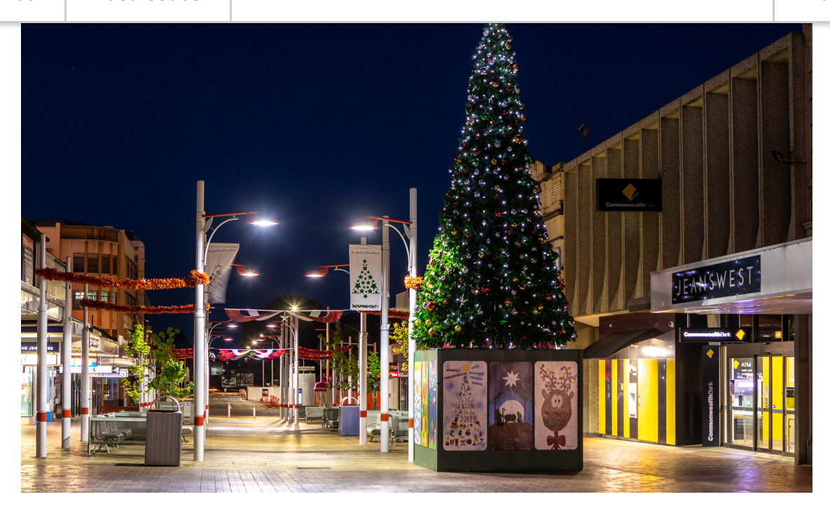
Rooke Street Mall Christmas Tree.