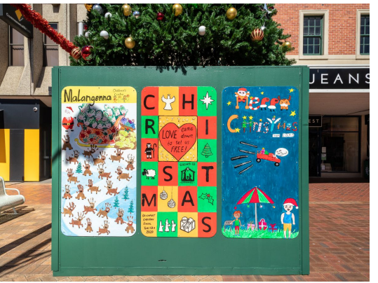
Rooke Street Mall Christmas Tree

This year Devonport have a new tree and new decorations funded by the Australian Government's Infrastructure Investment Program Stimulus: Supporting our Community.