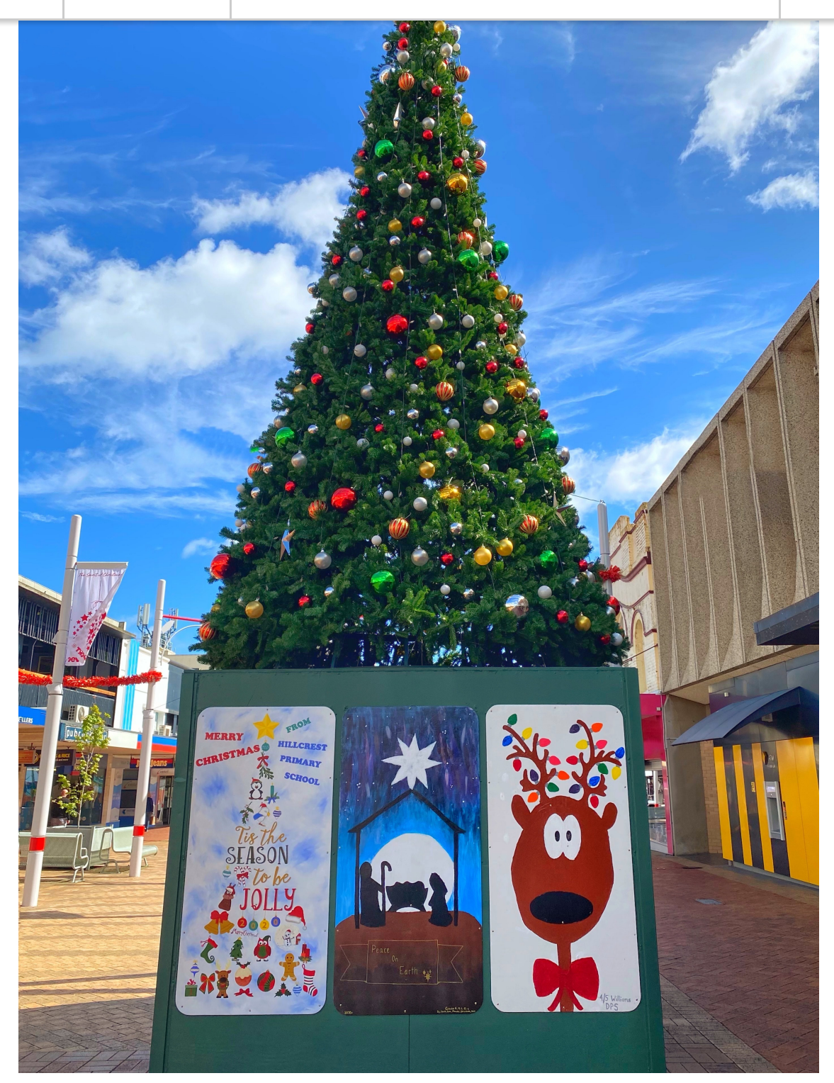
Christmas Tree