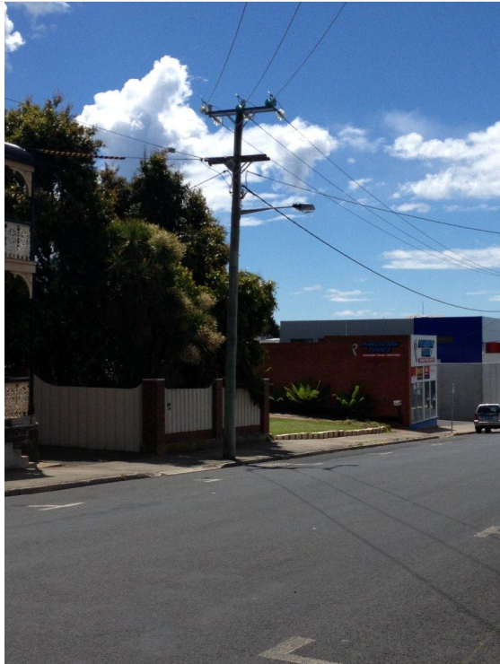
Figure 1 – Unmetered Lights on Aurora Energy Poles