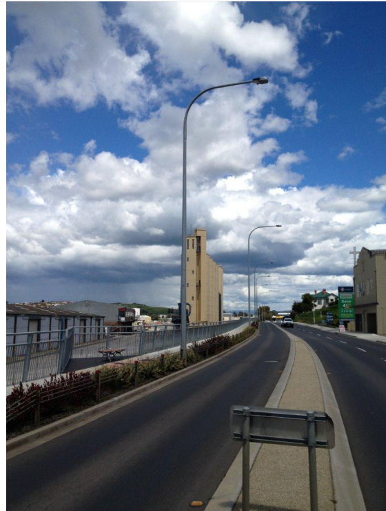
Figure 2 – Unmetered Lights on DCC Poles