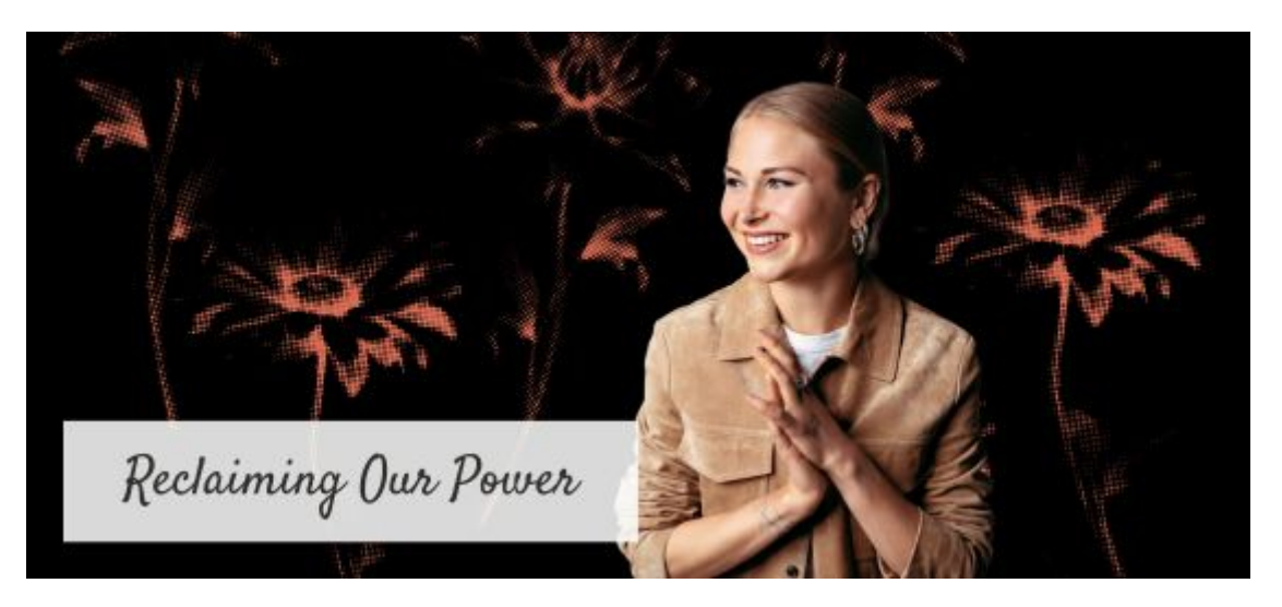
Grace Tame - Reclaiming Our Power

<u>Epilepsy Tasmania</u> is Tasmania's voice for Tasmanians with epilepsy, and those around them, through education, coordination and support.