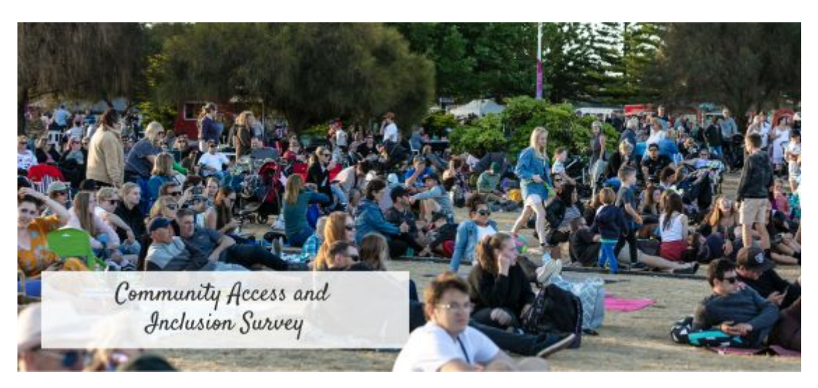
Mission Australia Community Access and Inclusion Survey

Find more information here: Community Support Fund Grants