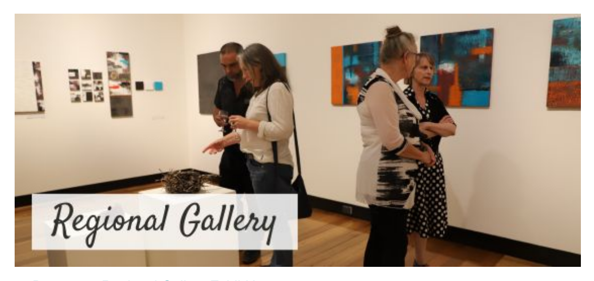
Devonport Regional Gallery Exhibitions

For further information, please contact Community Priorities and Partnerships by emailing <u>grants@dpac.tas.gov.au</u> or phoning on 1800 204 224.