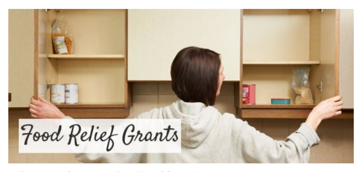
Tasmanian Community Food Relief Grants Program 2023

For not-for-profit Tasmanian local community organisations that currently provide food relief directly to members of their local community, to increase the provision of direct food relief for those in need.