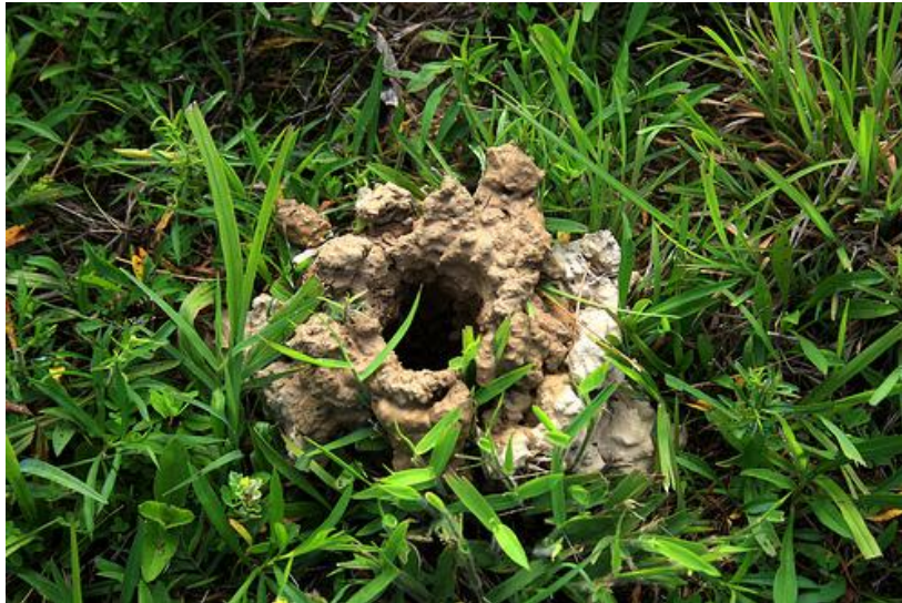
Fig B - Typical Burrowing Crayfish "Chimney"