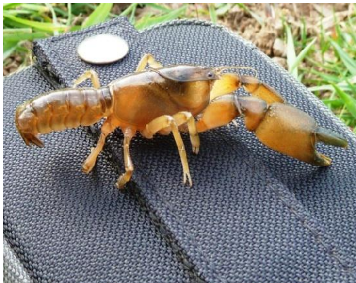
Fig A - Engaeus granulatus

Environment Protection Biodiversity Conservation Act 1999